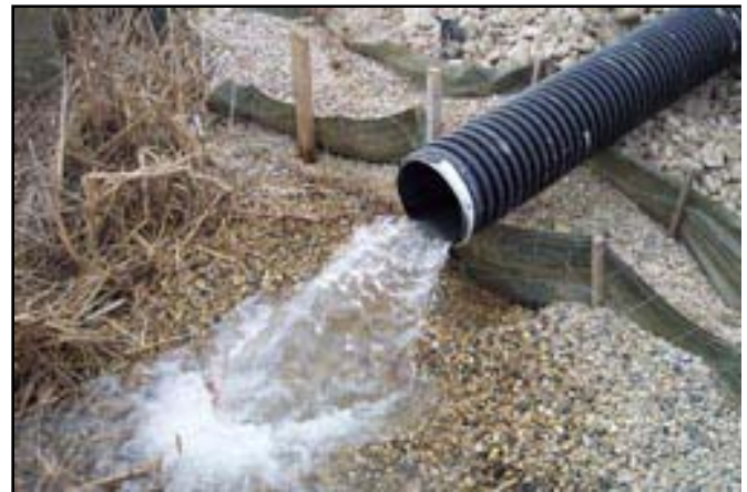
Discharge Water – At Conclusion of Baffle Grid

Silt Stop and Floc Log are trademarks of Applied Polymer Systems, Inc.