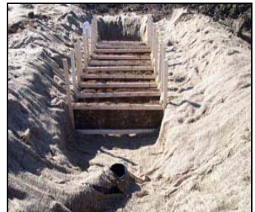
Foreground: effluent pipe Middle: baffle grid Background: grit pit