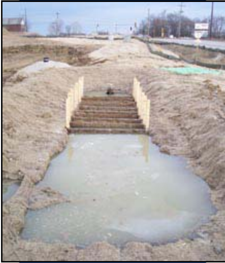
↑ ↓ During Operation

8' wide, 6' deep and 10' long while the downstream grid was 8' wide, 30' long and 2' deep. Both the pit and grid were stabilized using Applied Polymer Systems, Inc. [APS] Silt Stop® 705 polyacrylamide [PAM] blend and jute fabric. Within the grid, 10 jute baffles were constructed, allowing the flowing water to pass through the jute to the discharge pipe. Thelen placed 16 APS 706b Floc Logs® [semi-hydrated PAM blends] into the upper portions of the 1000' long, 15" pipe. The Floc Logs offered a passive method to introduce the appropriate flocculant-chelant into the treatment system.