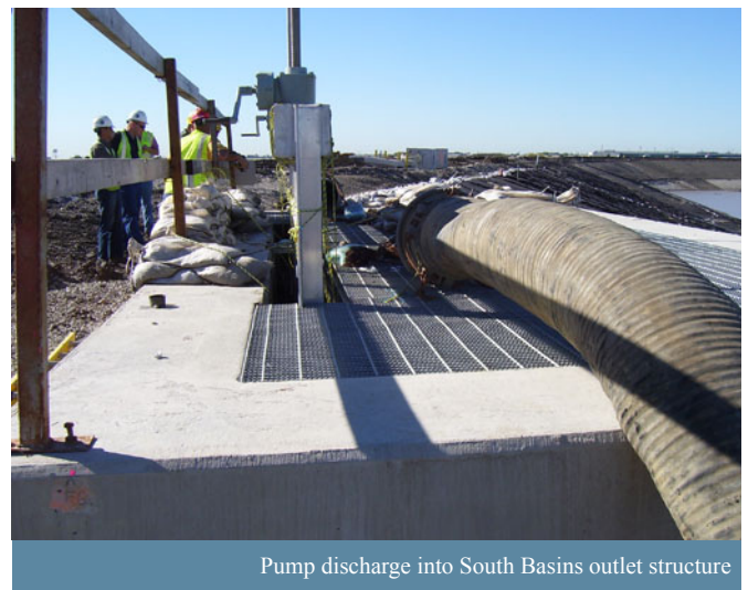
Pump discharge into South Basins outlet structure

laboratory analyses of the South Basin water's chemistry. In effect, the site specific analyses pinpointed which APS polymer blend provided the best results and offered guidance relative to dosage rates, mix time requirements,