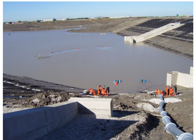
O'Hare South Basin - 75 million gallons in October 2008

After reviewing site plans, available operation locations, and hydraulic requirements/conditions, Ero-Tex's system suggestion involved the use of the South Basin's discharge infrastructure for chemical introduction, appropriate mixing and floc [soil-polymer agglomeration] removal. The one concern in using this in-place infrastructure approach: no fail-safe system was available - the water had to be continuously clarified from pump start-up to system shutdown during the 3-4 week, 24/7 pumping schedule. Regardless, all parties agreed that Ero-Tex's plan was both logical and economical.